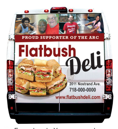
Example only. Your message here.

To learn more about Drive For Action please contact Gloria Depaolo, 718-531-7500 ext. 312